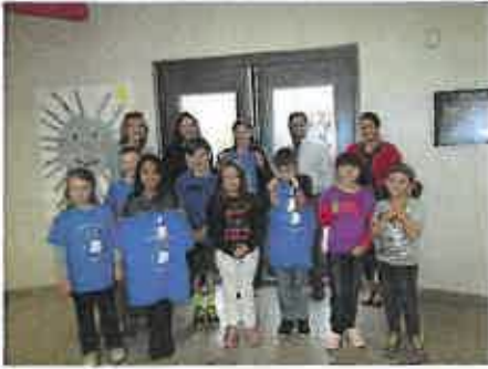
Weekly and monthly Helping Hand drawing winners